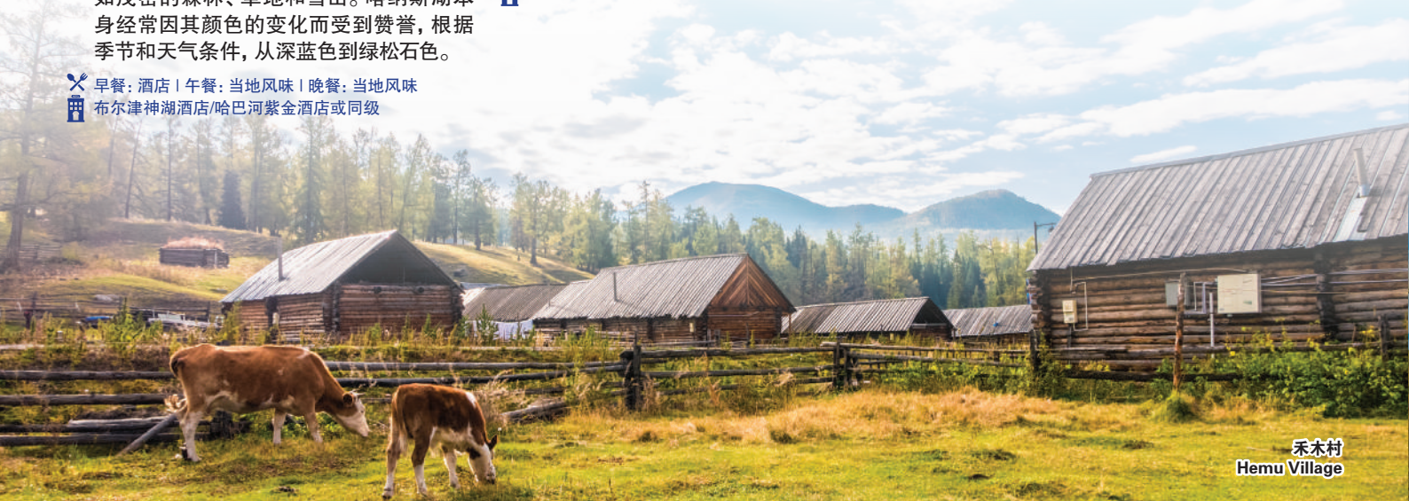
禾木村 Hemu Village