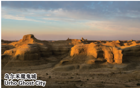
乌尔禾魔鬼城 Urho Ghost City

✂️ Breakfast: Hotel | Lunch: Local Cuisine | Dinner: Local Cuisine 🏠 Jiadengyu Four Season Leisure Hotel or similar