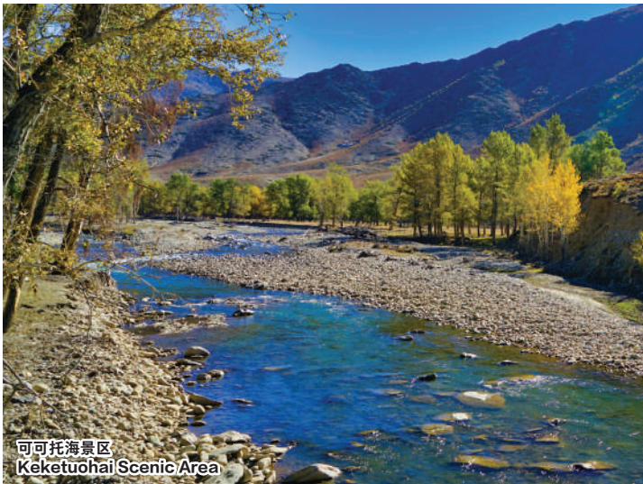
可可托海景区 Keketuohai Scenic Area

美食: 新疆大盘鸡 | 冷水鱼 | 黄面烤肉 | 手抓饭 | 新疆拌面 | 川菜风味 | 野蘑菇炖鸡 | 新疆烤全羊 GOURMET: Xinjiang Big Plate Chicken Cuisine | Cold Water Fish | Grilled Yellow Noodles | Rice Pilaf | Sichuan Cuisine Flavor | Wild Mushroom Stewed Chicken | Roasted Whole Lamb