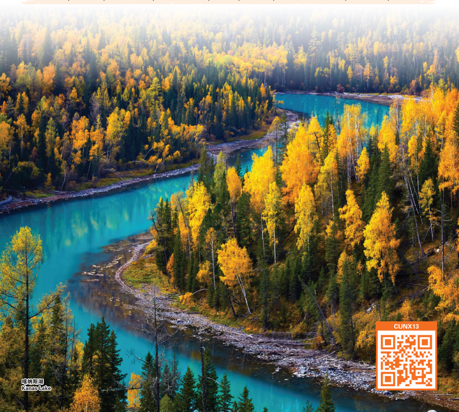
喀纳斯湖 Kanas Lake

乌鲁木齐 | 可可托海 | 禾木村 | 喀纳斯 | 奎屯 | 那拉提草原 | 独山子 | 吐鲁番 URUMQI | URUMQI | KEKETUOHAI | HEMU VILLAGE | KANAS | KUYTUN | NALATI GRASSLAND | DUSHANZI | TURPAN