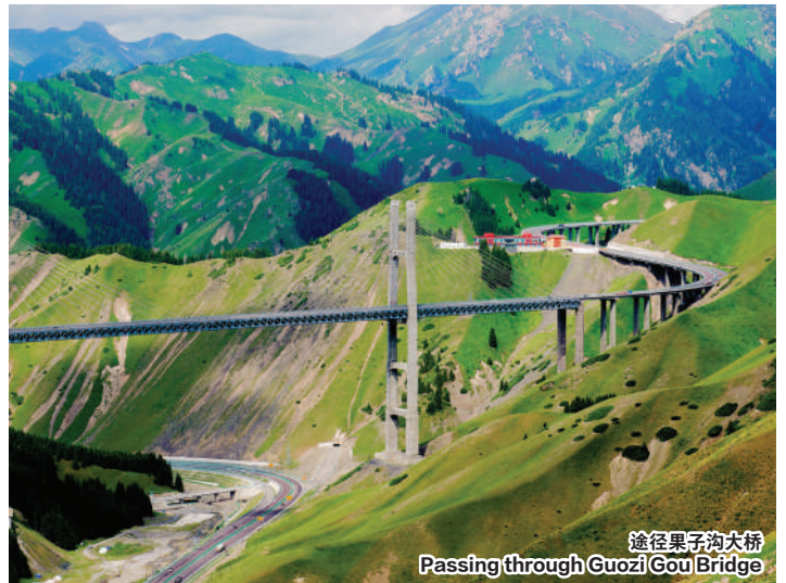
途径果子沟大桥 Passing through Guozigou Bridge